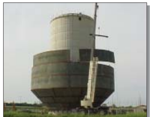
1.5 Million Gallon Water Tower Project