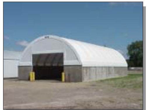
New Salt Storage (located at the City Complex on N. Euclid)