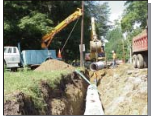
East Peru Street Storm Sewer Installation