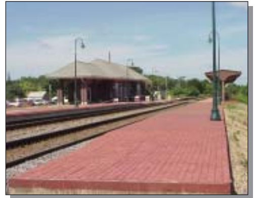
Train Depot Renovation