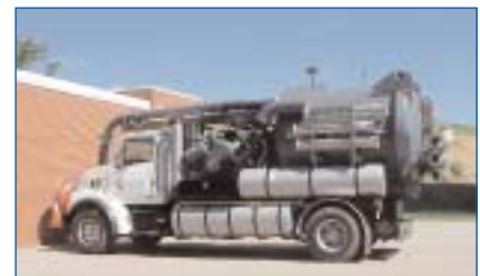
Vector Truck (Sanitary Sewer Maintenance)