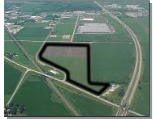
70 Acre Technology Park