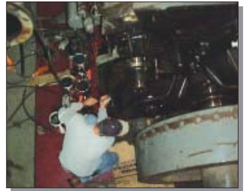
Power Plant Timing Gear Repair