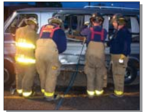
Fire Department/EMT Continued Training