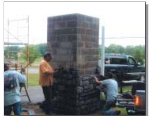
Cemetery Pillar Restoration Project